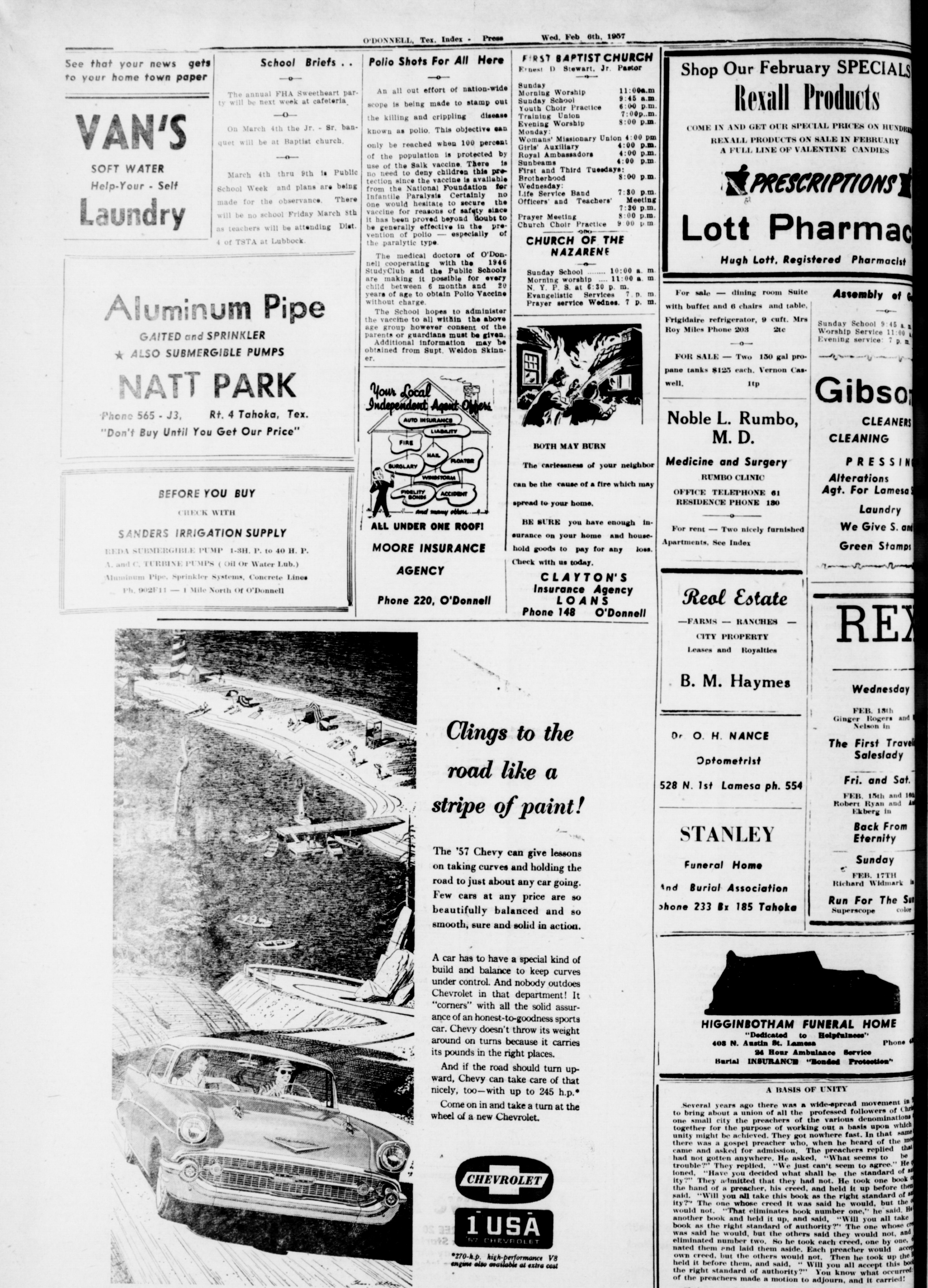
at's Chevrolet all over. Above, you're looking at the Bel Air Sport Coupe.