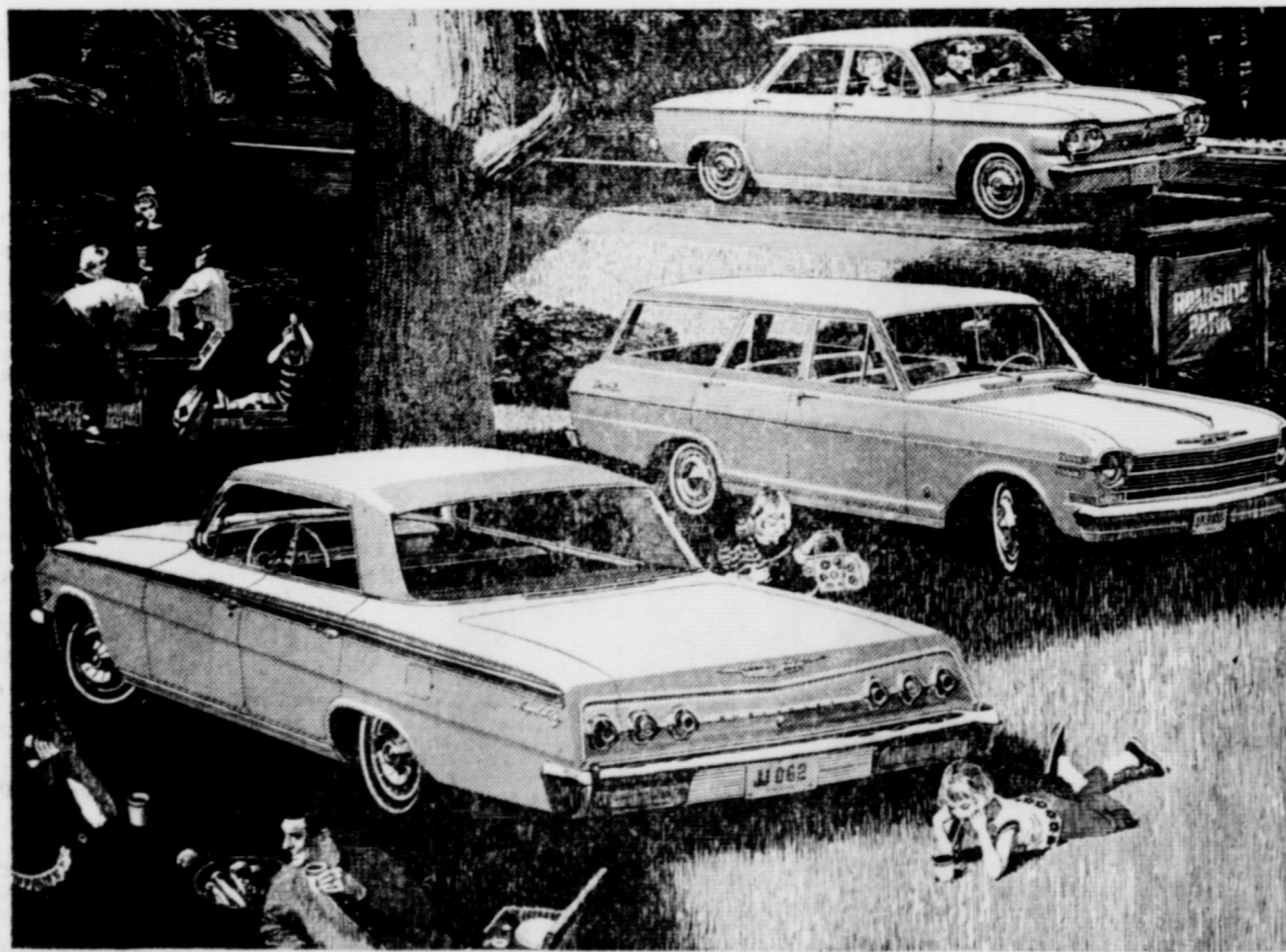
Chevrolet Impala Sport Sedan (foreground) Chevy II Nova 4-Door Station Wagon Corvair Monza 4-Door Sedan (background)

Not just three sizes... but three different kinds of cars... Chevrolet!