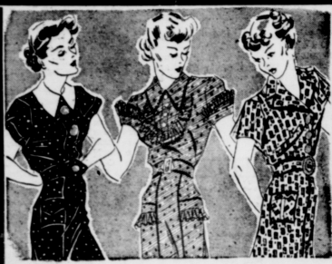
S1.00 LADIES' PRINT DRESSES

And Must Clear Out All Old Merchandise Ve Ne Re-stock All New Throughout! Everyth! In This Sensational, Sea