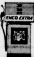
Here's that Tiger.

You're a skeptic. Good. Then you're going to be a good customer, if we can ever win you. We showed you proof on television that High-energy Enco Extra cleans your carburetor while you drive. (Probably you said, "So what? My car still runs.")