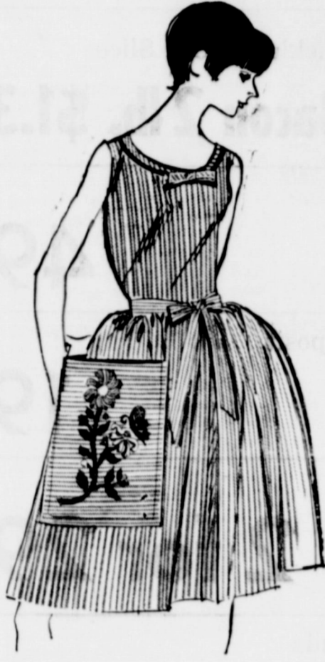
Lounge Craft $9.95

Free Pickup & Delivery - Call 428-3744 (Across Street from City Hall)