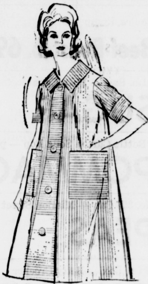
Lounge Craft $8.95