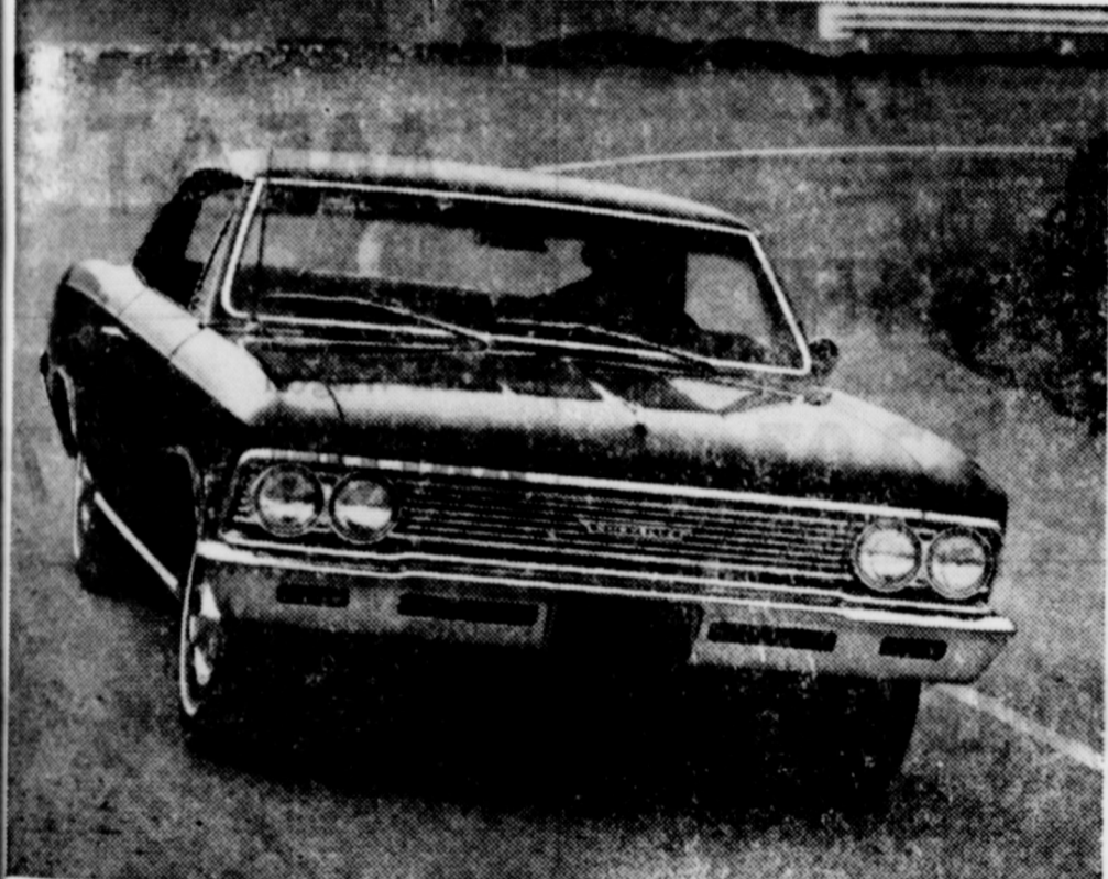
Chevelle Malibu Sport Coupe—with eight new standard safety features, including outside rearview mirror and shatter-resistant inside mirror. Always check both mirrors before pulling out to pass.

TEXAS ELECTRIC SERVICE COMPANY W. B. MITCHEL, Manager 428-3322