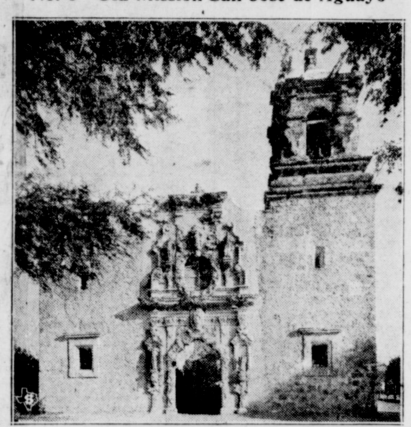
Mission San Jose de San Miguel Aguayo was founded in 1720 and is conceded by authorities to be the most pretentious and beautiful of all the old Spanish Missions in America...