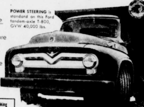
POWER STEERING is standard on this Ford tandem-axle T-800, GVW 40,000 lbs.

The new Ford Trucks for '55 save money—of course! But even more important, they help you make more money—with new TRIPLE ECONOMY features to get jobs done faster, more efficiently! They let you make every run an "Economy Run"!