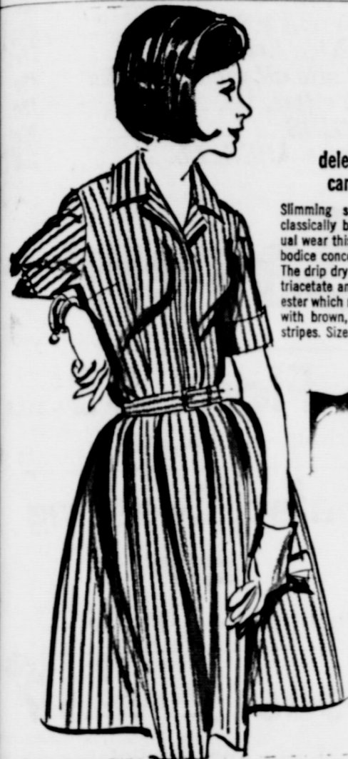
delectable chic: candy stripes

24 Hour AMBULANCE SERVICE 403 N. Austin Ave., Lamesa, Texas, Phone 872-8375 OXYGEN EQUIPPED AIR CONDITIONED BRANON - PHILIPS FUNERAL HOME "DEDICATED TO HELPFULNESS"