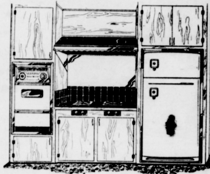
Illustrated above is the Universal Built-In Automatic Gas Range. Also shown is the Servel Gas Refrigerator that features the automatic ice-maker.

Better your living . . . Bless your budget