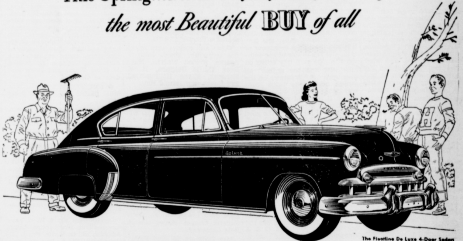
The Fleetline De Luxe 4-Door Sedan. White sidewall tires optional at extra cost.

This Spring...it seems everybody's fancy is turning to the most Beautiful BUY of all