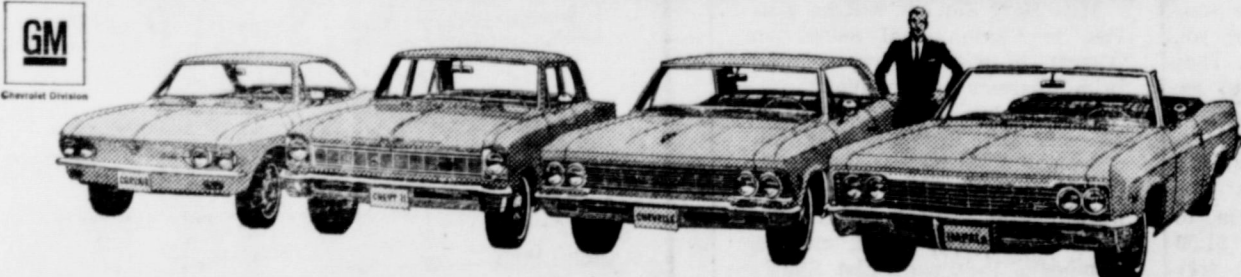
Left to right: Corvair Monza Sport Coupe, Chevy II Nova 4-Door Sedan, Chevelle Malibu Sport Coupe and Chevrolet Impala Convertible. Each comes with an outside rearview mirror and seven other standard features for your added safety. Always check your mirror before you pass.

That's the beauty of buying America's most popular make of car—especially right now when summer savings are extra tempting. It just makes sense that you're going to save in a big way by seeing the man who's doing business in a big way. So go see what