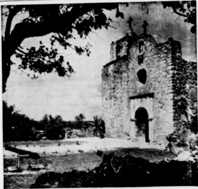
GOLIAD — Presidio La Bahia, where the Goliad Declaration of Independence was drawn in 1835. Sunday mass is still celebrated here. Nearby is a monument to Col. Fannin and his men who were massacred in 1836.

When adverse weather severely damages seedling cotton, a farm management specialist says it will pay to do a little figuring to learn if it is most profitable to replant to cotton or to some other crop such as soybeans or castors. Government programs, available