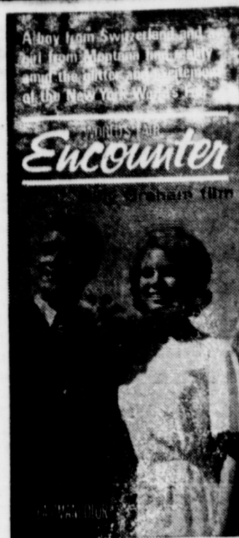
First Baptist Church O'Donnell, Texas