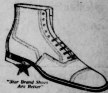
"Star Brand Shoes Are Better"

In order to make our spring shipment, making some attractive