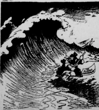
Talbot in Washington Daily News