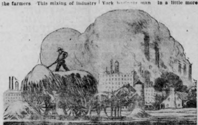
Mixing Industry With Agriculture Means Prosperity for Rural Districts

Twelve years ago Kingsport, Tenthousand Great industries like a large camera company, a big cement plant and a number of other industries were located there partly through the influence of an outstanding New