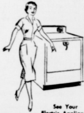
See Your Electric Appliance Dealer

Free yourself from the dishwashing chore...with an Electric Dishwasher