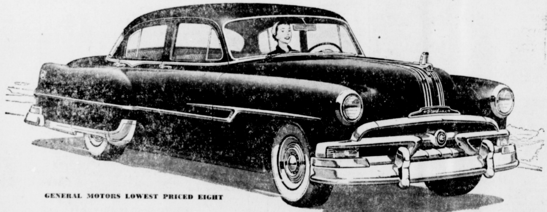
GENERAL MOTORS LOWEST PRICED EIGHT