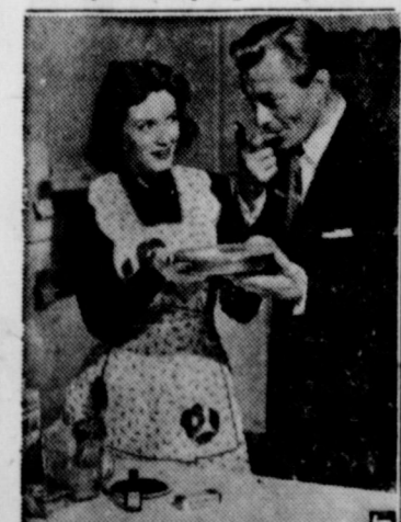
DETECTIVE IN THE KITCHEN - Mr. and Mrs. North solve a mystery - and really enjoy it at the same time.