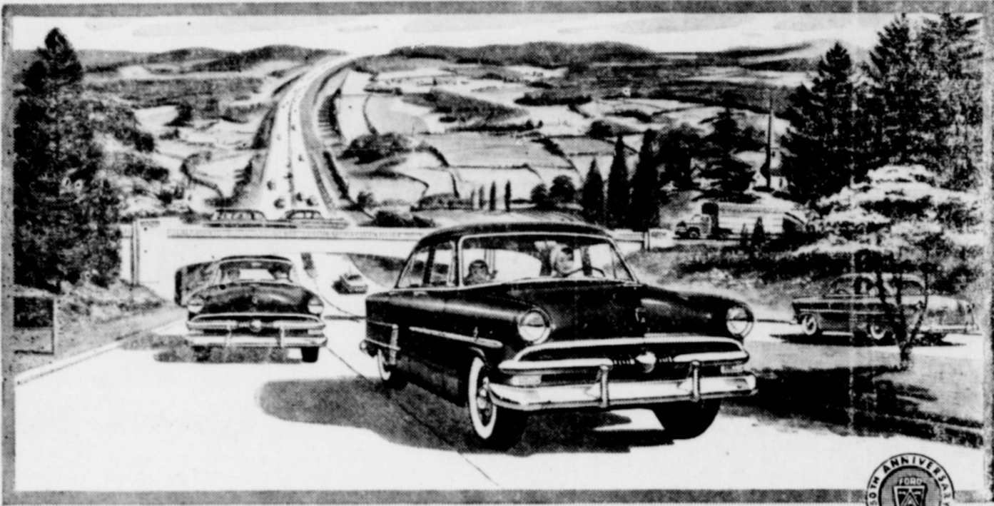
Fifty Years Forward on the American Road

AND IT'S STILL THE ONLY V-8 IN THE LOW-PRICE FIELD! No other engine in the world has enjoyed so much popularity as Ford's power-packed high-compression V-8. Today, 4 out of every 5 V-8's are Ford V-8's. And while other makers are scrambling to catch up, Ford and Ford alone offers a V-8 in the low-price field . . . and for hundreds less than most others.