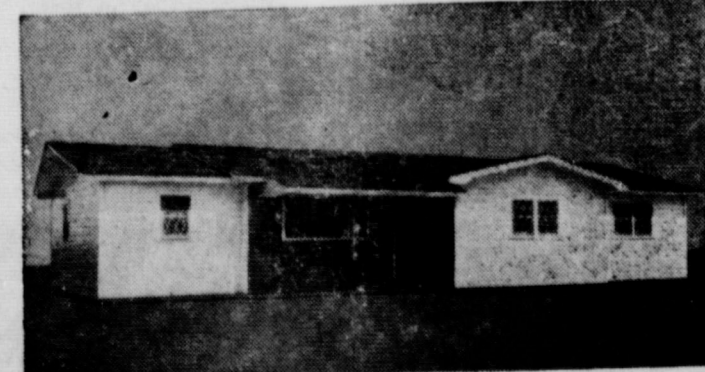
Turnkey finished, and built to move ANYWHERE by qualified bonded movers. This house is waiting to be your home, the envy of any neighborhood, with attractive picture window, diamond-light screens, long-life cedar roof. Any Avinger house carries a 100% warranty for ONE FULL YEAR on all workmanship and materials.