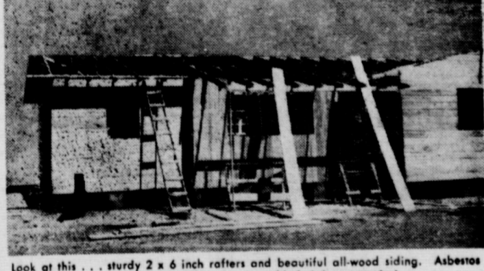
Look at this... sturdy 2 x 6 inch rafters and beautiful all-wood siding. Asbestos siding or brick veneer if you choose. An added Avinger service!