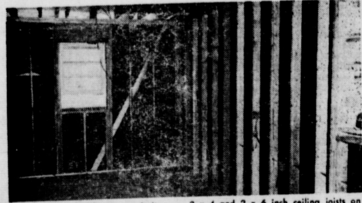
More secrets of Avinger superiority... 2 x 4 and 2 x 6 inch ceiling joists on 16-inch centers! At this stage, it's ready for beautiful hardwood flooring.