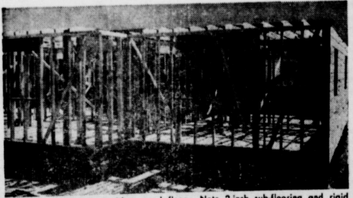
A quality house starts with a good floor. Note 2-inch sub-flooring and rigid corners at very beginning of this skillfully-built Avinger house.