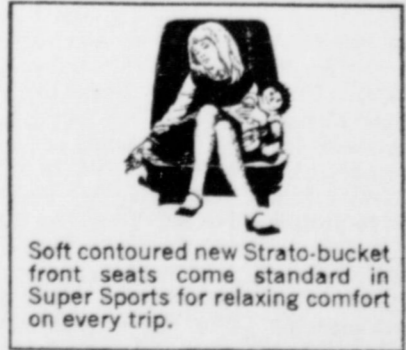
Soft contoured new Strato-bucket front seats come standard in Super Sports for relaxing comfort on every trip.

We added new bushings and softened body-to-frame mounts to smooth Chevrolet's ride. We put in soft-acting shock absorbers and soft-working coil springs at every wheel. By soft, though, we don't mean mushy. Chevrolet's Way makes for a smooth, solid ride. Very steady on curves. A bump jumps from the Wide-Stance wheels to the supple springs and shocks—and poof! It all but disappears.