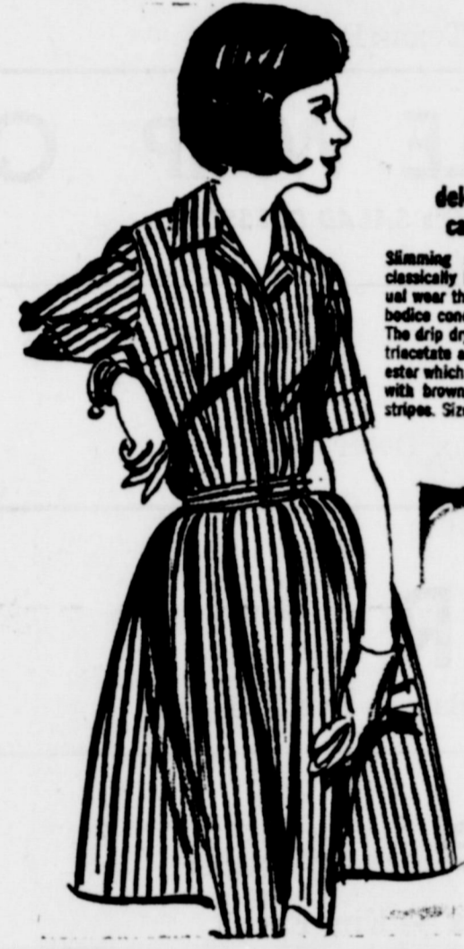
delectable chic: candy stripes

TEXAS PRESS ASSOCIATION 1716 SAN ANTONIO STREET GREENWOOD 7-8788 AUSTIN, TEXAS 78704