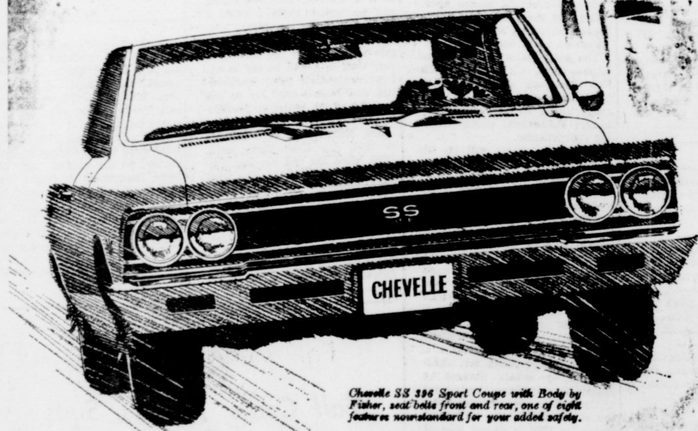
Chevelle SS 396 Sport Coupe with Body by Fisher, seat belts front and rear, one of eight features nonstandard for your added safety.

For the guy who'd rather drive than fly: Chevelle SS 396