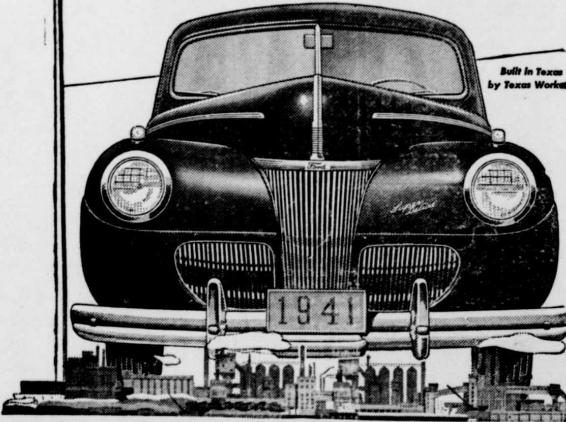
Built in Texas by Texas Workers

Drive it, and we know you'll agree IT'S THE FINEST JOB THE GREAT FORD PLANT EVER DID!