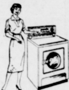
LIVE BETTER ELECTRICALLY — dry clothes for an average of about 5¢ a load in an Electric Clothes Dryer.

No more "clothesline accidents" when you have an Electric Clothes Dryer