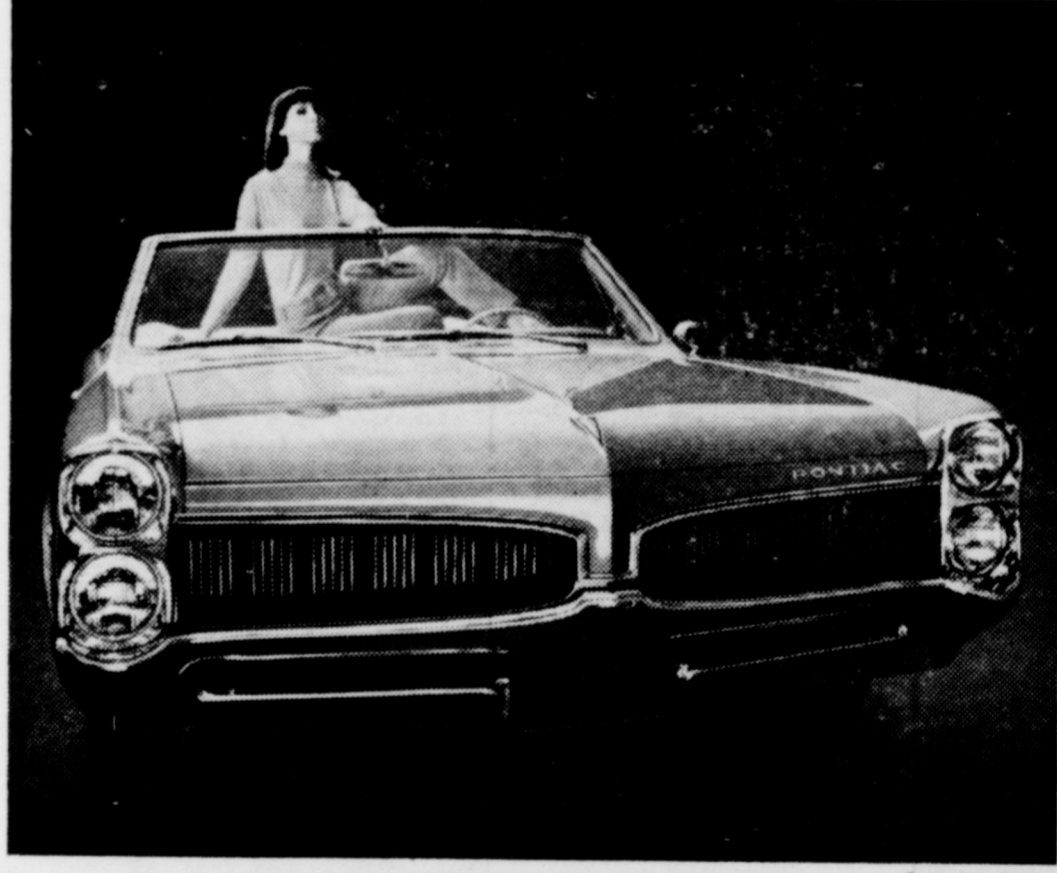
Pontiac Motor Division

What'd you expect us to put our Overhead Cam Six in?