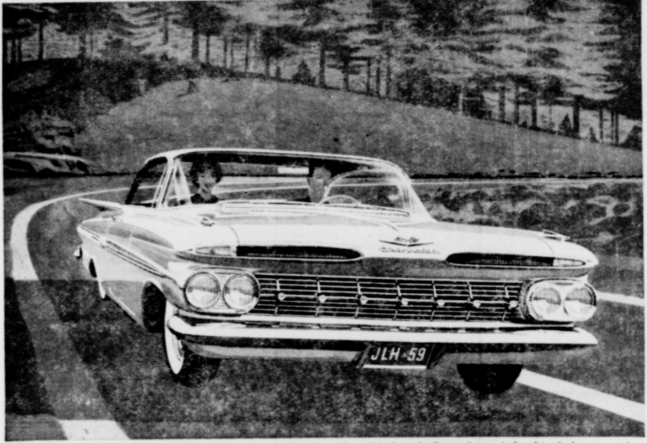
More car than this Impala Sport Coupe is hard to find at any price.

clings to curves like a cat on a carpet! the travel-lovin' Chevrolet