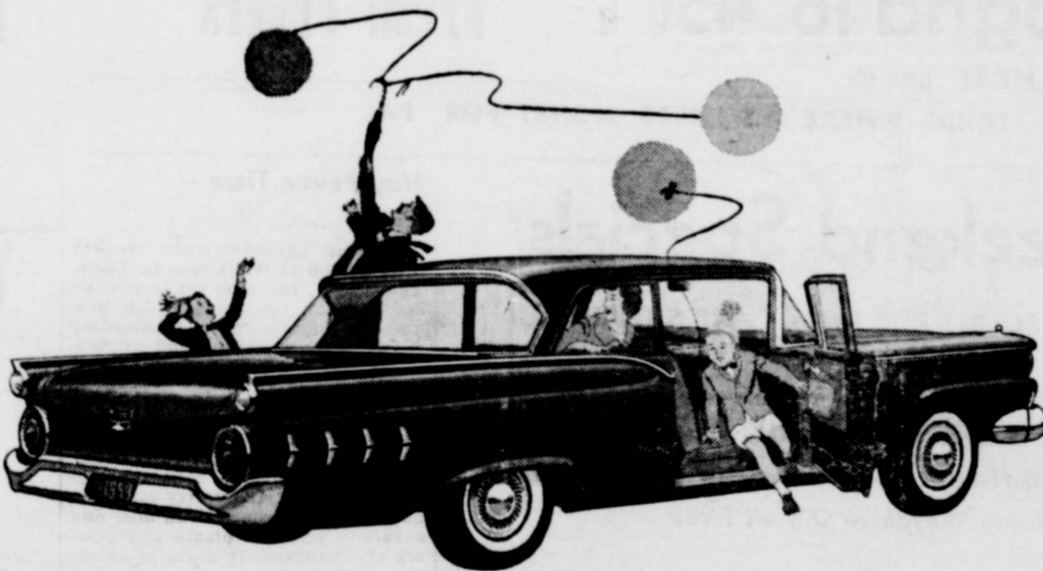
Ford Custom 300 Tudor

WORLD'S MOST BEAUTIFULLY PROPORTIONED CARS