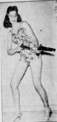
Pretty Clono Price, one of the Fair's Golden Forties Girls, takes two rare firearms relics and "goes Western" in a big way on Treasure Island in San Francisco Bay. The guns are from the $10,000 Krobel collection now on display.

ton interests. Under the new plan, arrangements have been perfected enabling the producer to make his nickel-a-bale contribution at the first point of sale, either to the cotton merchant large or small, or the ginmer or warehouseman acting as merchant. This contribution is carried on from merchant to compressor, who remits the accumulated funds to the Council when the bale is first compressed, or from merchant to textile mill which remits on uncompressed cotton.