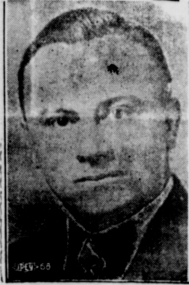
GOV. W. LEE O'DANIEL