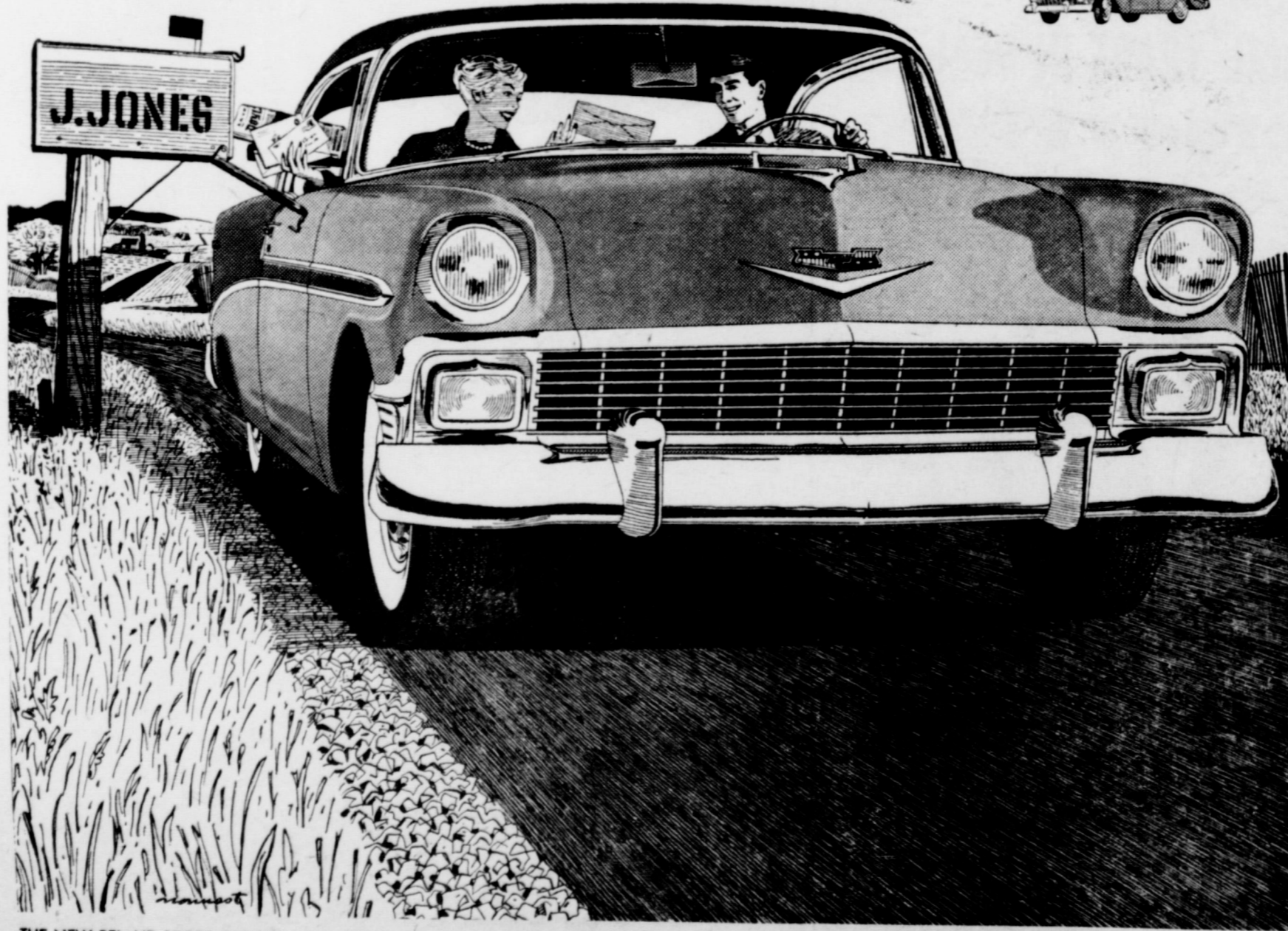
THE NEW BEL AIR SPORT COUPE with Body by Fisher—one of 20 frisky new Chevrolet models.