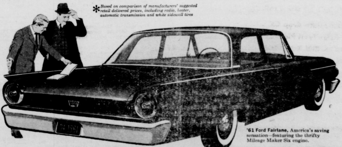
'61 Ford Fairlane, America's saving sensation—featuring the thrifty Mileage Maker Six engine.

*Based on comparison of manufacturers' suggested retail delivered prices, including radio, heater, automatic transmission and white sidewall tires