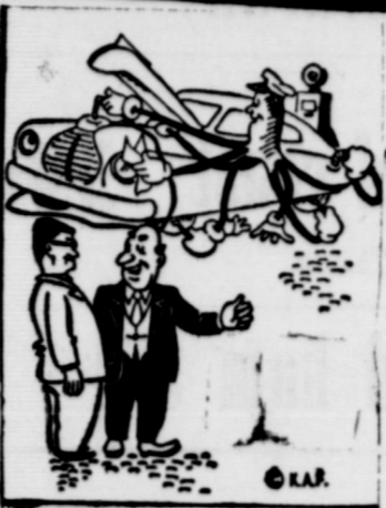
"Best doggoned service man I ever saw."