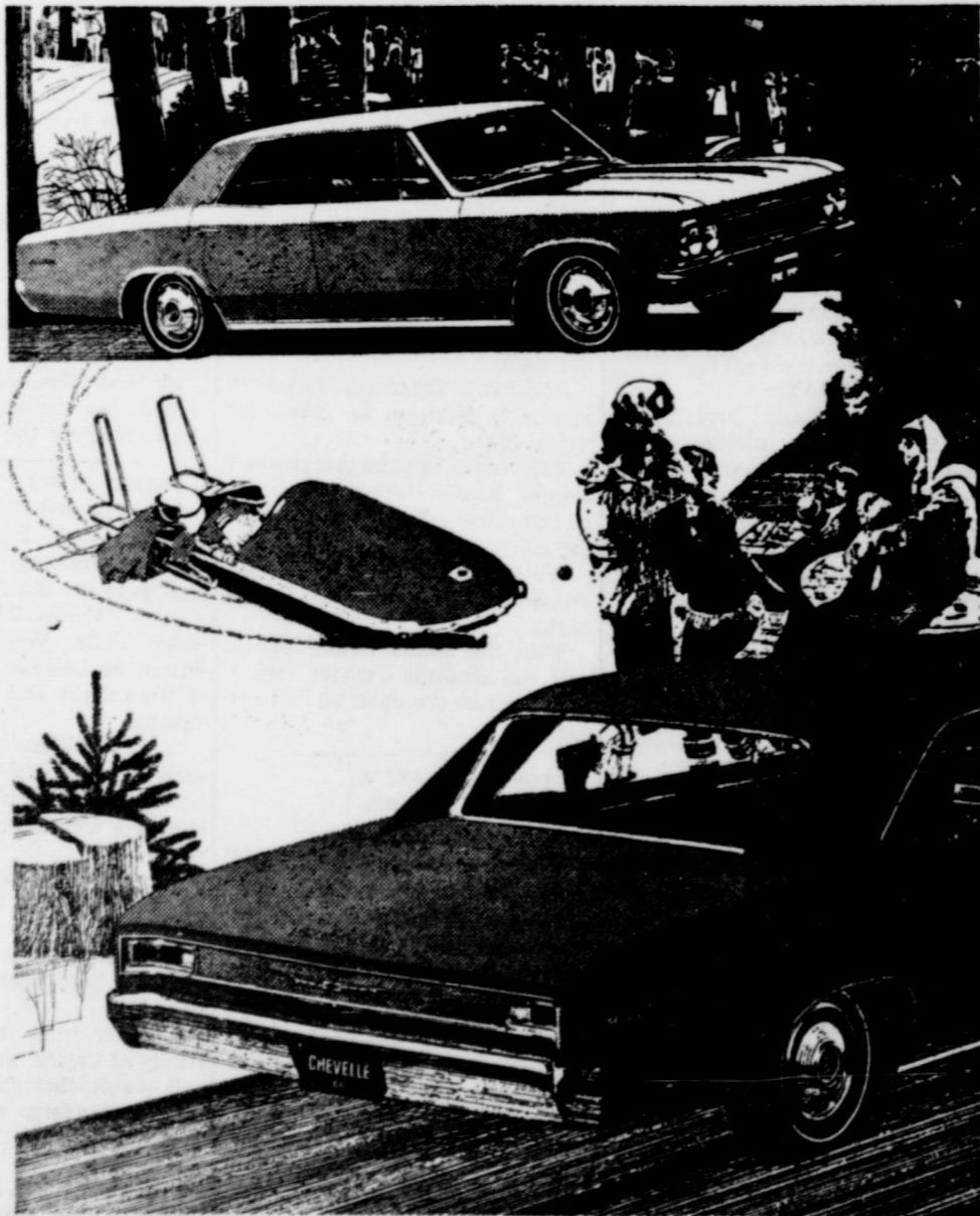
'66 Chevelle Malibu Sport Coupe (foreground) and new 4-door Malibu Sport Sedan.