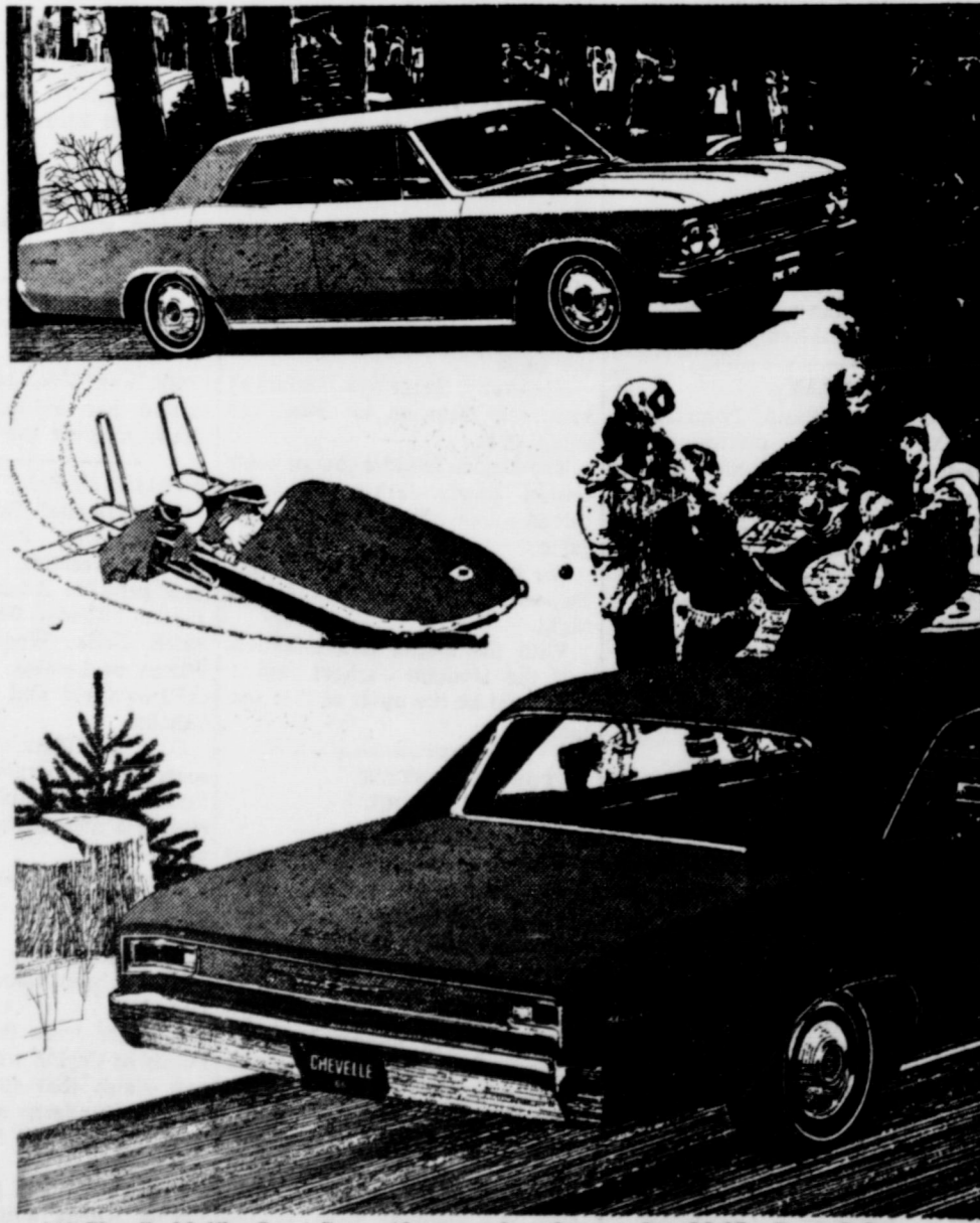
'66 Chevelle Malibu Sport Coupe (foreground) and new 4-door Malibu Sport Sedan.