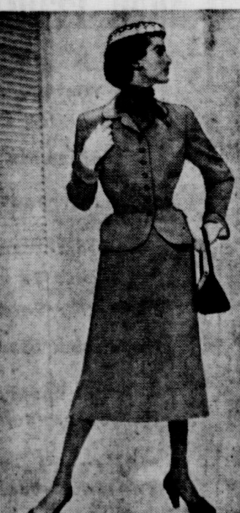
tailored by Frank Gallant into a wonderfully wearable suit. The jacket is simple and slightly curved over a slender skirt.

Ruffles on many seasonal blouses and dresses give away and fray before the body of the garment does. Add new ruffling and increase the life of the clothing and at the same time give it an interesting new look.