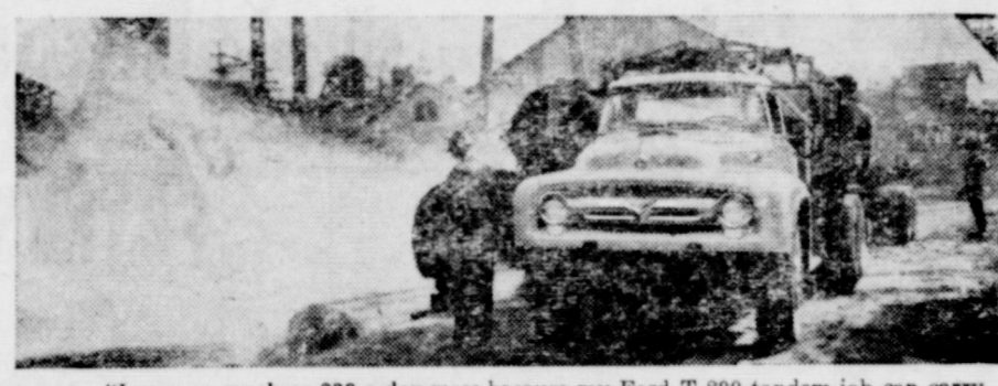
"I earn as much as $30 a day more because my Ford T-800 tandem job can carry