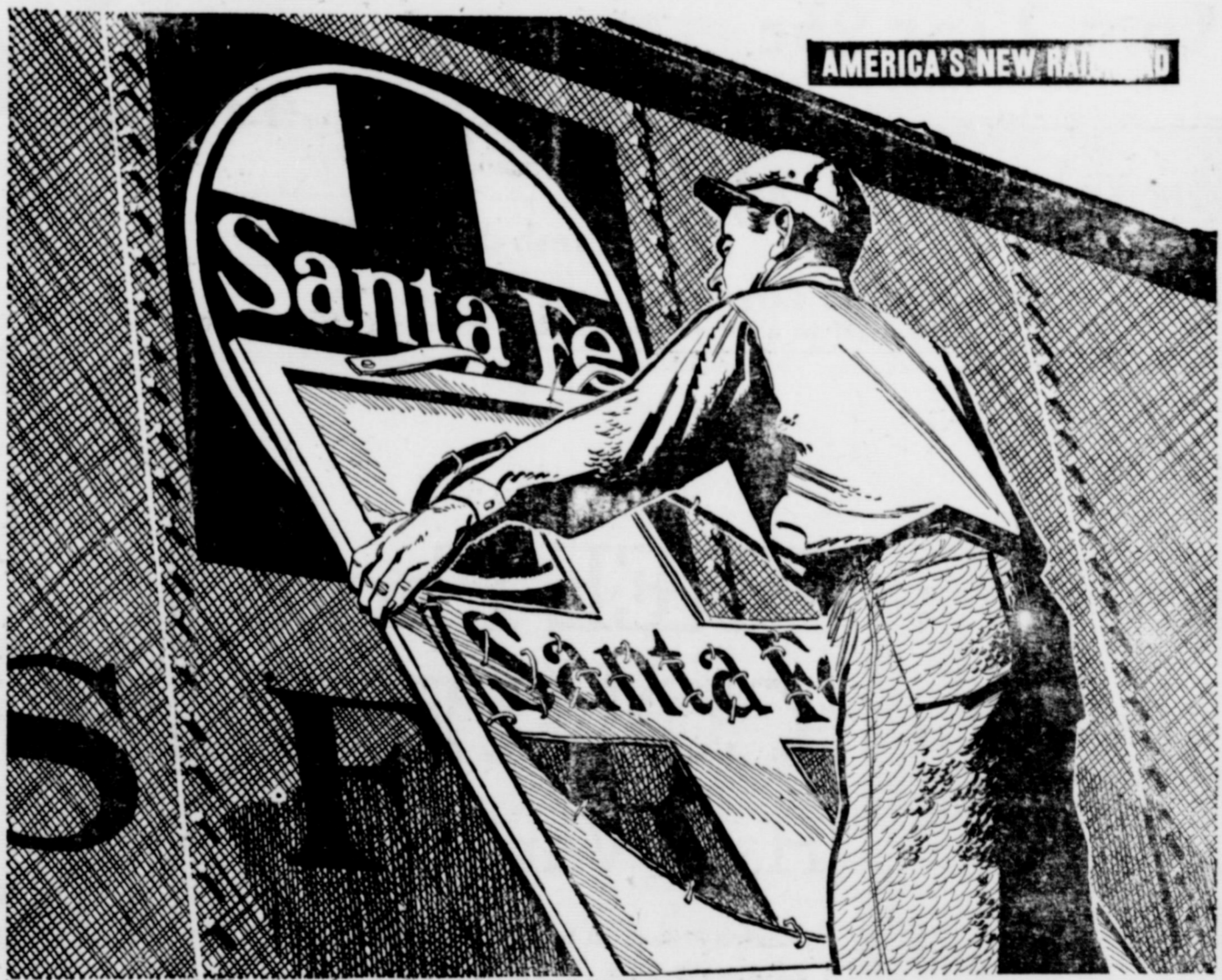
The "stamp of newness"—and another new Santa Fe freight car is ready to roll

21 miles of new freight cars added by Santa Fe last year!