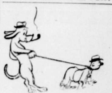
MAN'S BEST FRIEND

MACHINERY SUPPLY CO., INC. Pecos, Tex. Phone Hi. 5-2407