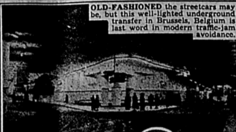
OLD-FASHIONED streetcars may be, but this well-lighted underground transfer in Brussels, Belgium is last word in modern traffic-jam avoidance.