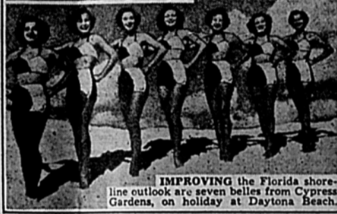
IMPROVING the Florida shoreline outlook are seven belles from Cypress Gardens, on holiday at Daytona Beach.