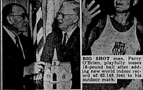
BIG SHOT man, Parry O'Brien, playfully tosses 16-pound ball after adding new world indoor record of 63.148 feet to his outdoor mark.