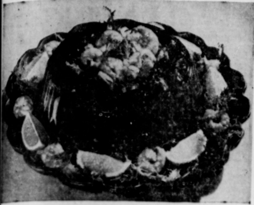
Keep Cool With Shrimp Salad in Aspic (See Recipes Below)