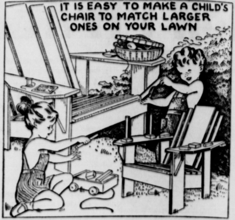
IT IS EASY TO MAKE A CHILD'S CHAIR TO MATCH LARGER ONES ON YOUR LAWN

HERE is a pint-size lawn chair to delight the children and their young visitors. The seat is 10 1/2 inches high, 13 inches deep and 15 inches wide—a good size for little ones now and roomy enough to be comfortable right up through their early teens.