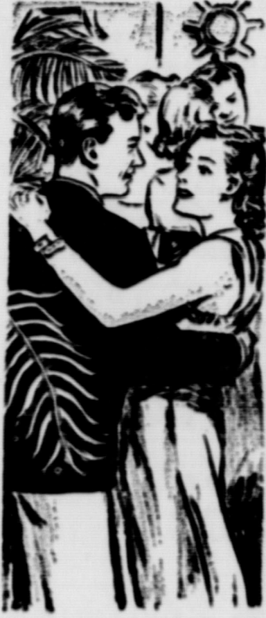
He took her lightly in his arms and they started to dance.

He slowly grinned, turned and went into the other room. He returned with a white flower in his hand. It looked a little like a gar-