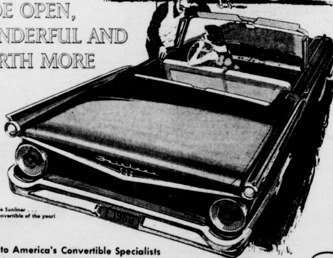
The Galaxie Sunliner... glamour convertible of the year!

Look to America's Convertible Specialists for sunshine living at its best!