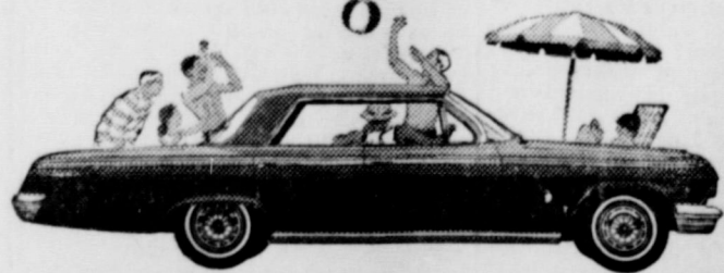
Chevrolet Impala Sport Sedan - Jet-smooth . . . rivals the expensive makes.