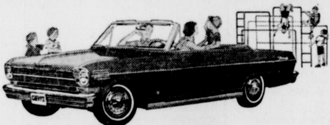
Chevy II Nova Convertibles - Thrifty way to get in on top-down traveling!