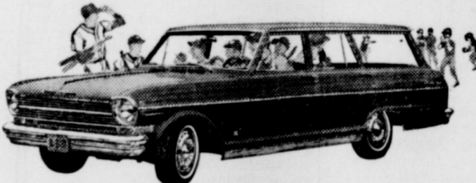
Chevy II Nova Station Wagon - Family-sized, easy to park, pack, pay for!