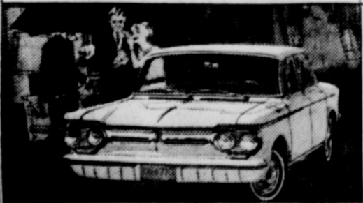
Corvair Monza 4-Door Sedan - Sports car spice on the family plan.