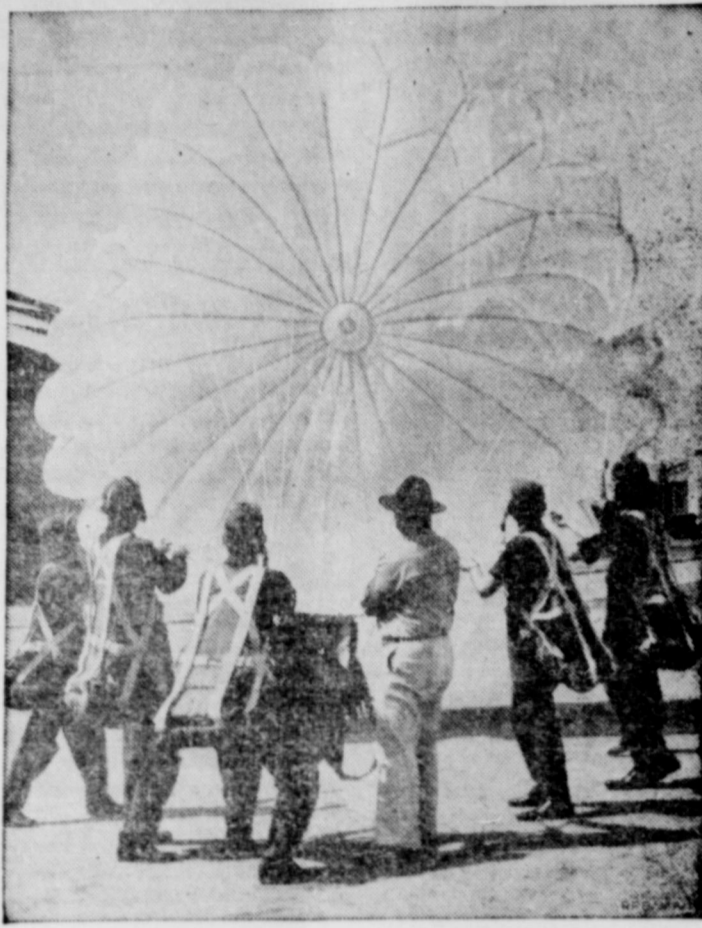
They call it an "Aerial Life Raft," though it's just a parachute to most of us. Flying Cadets of the Army Air Corps are thoroughly familiar with the twenty-four-foot "silk umbrella" before they leave the ground in a plane, and while in the air each carries a parachute of his own. They may never use it in an emergency but, as in this class, they learn what to do with it and how to handle it. They will never go up without it. Here, a master sergeant of the Air Corps pulls the rip cord of a parachute in a demonstration to Flying Cadets at the "West Point of the Air," Randolph Field, Texas.