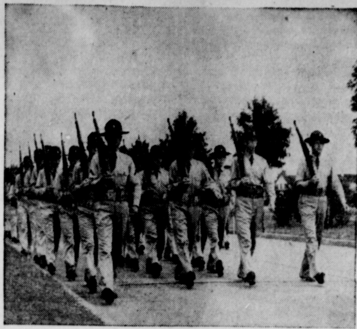
This smartly-stepping model platoon of the 29th Infantry at Fort Benning, Georgia, home of The Infantry School, swings out at 120 steps a minute in a modern column of threes. Precision and coordination are necessary to bring foot soldiers to their highest efficiency both in garrison and in the field. Doughboys who travel on foot are still called "the backbone of the Army." This photo shows how many of the men recently registered for service will look after they become highly trained.