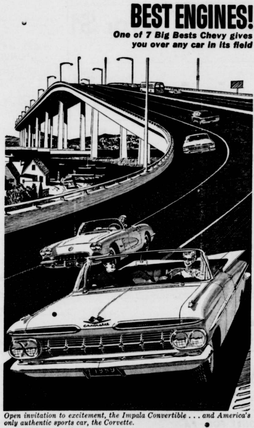
Open invitation to excitement, the Impala Convertible... and America's only authentic sports car, the Corvette.

8:00 Roy Rogers 9:00 Howdy Doody 9:30 Ruff and Ready 10:00 Fury 10:30 Circus Boy 11:00 True Story 11:30 TBA 11:45 Leo Durocher 11:55 Ball Game 2:45 Scoreboard 3:00 Movie 5:30 Detective's Diary 6:00 Lone Ranger 6:30 People Are Funny