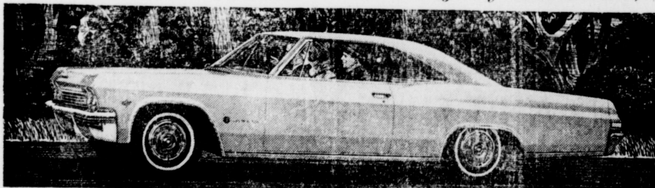
CHEVROLET—As roomy a car as Chevrolet's ever built. Chevrolet Impala Sport Coupe

Discover the difference in the '65 Chevrolets (As different from other cars as they are from each other)