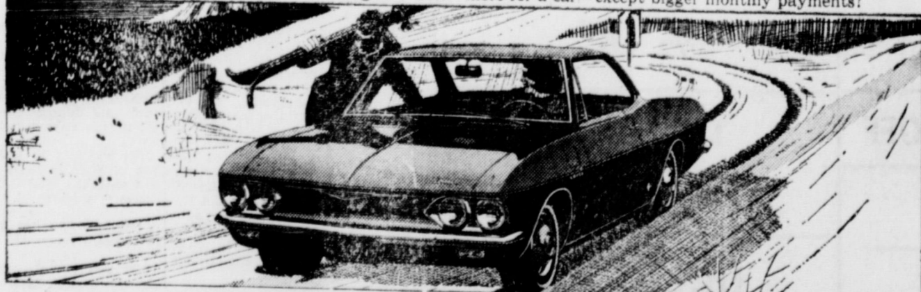
CORVAIR—The only rear engine American car made. Corvair Corsa Sport Coupe

When you take in everything, there's more room inside this car than in any Chevrolet as far back as they go. It's wider this year and the attractively curved windows help to give you more shoulder room. The engine's been moved forward to give you more foot room. So, besides the way a '65 Chevrolet looks and rides, we now have one more reason to ask you: What do you get by paying more for a car—except bigger monthly payments?