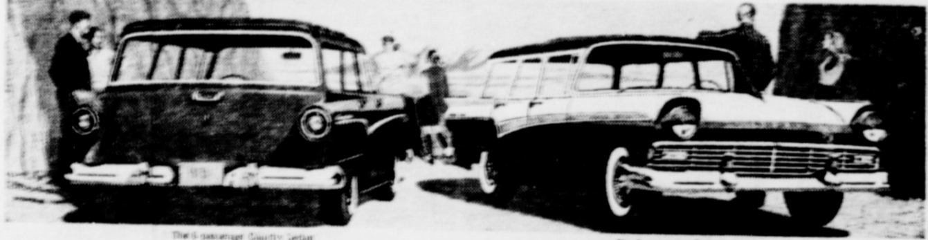
The 6-passenger Country Squire