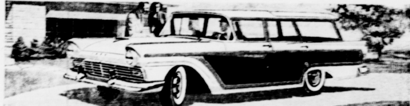
The 3-passenger Country Squire