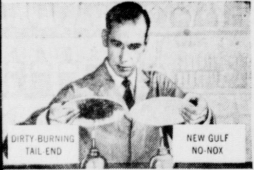
DIRTY BURNING TAIL END NEW GULF NO-NOX

Gives more miles per gallon ... more miles per quart!