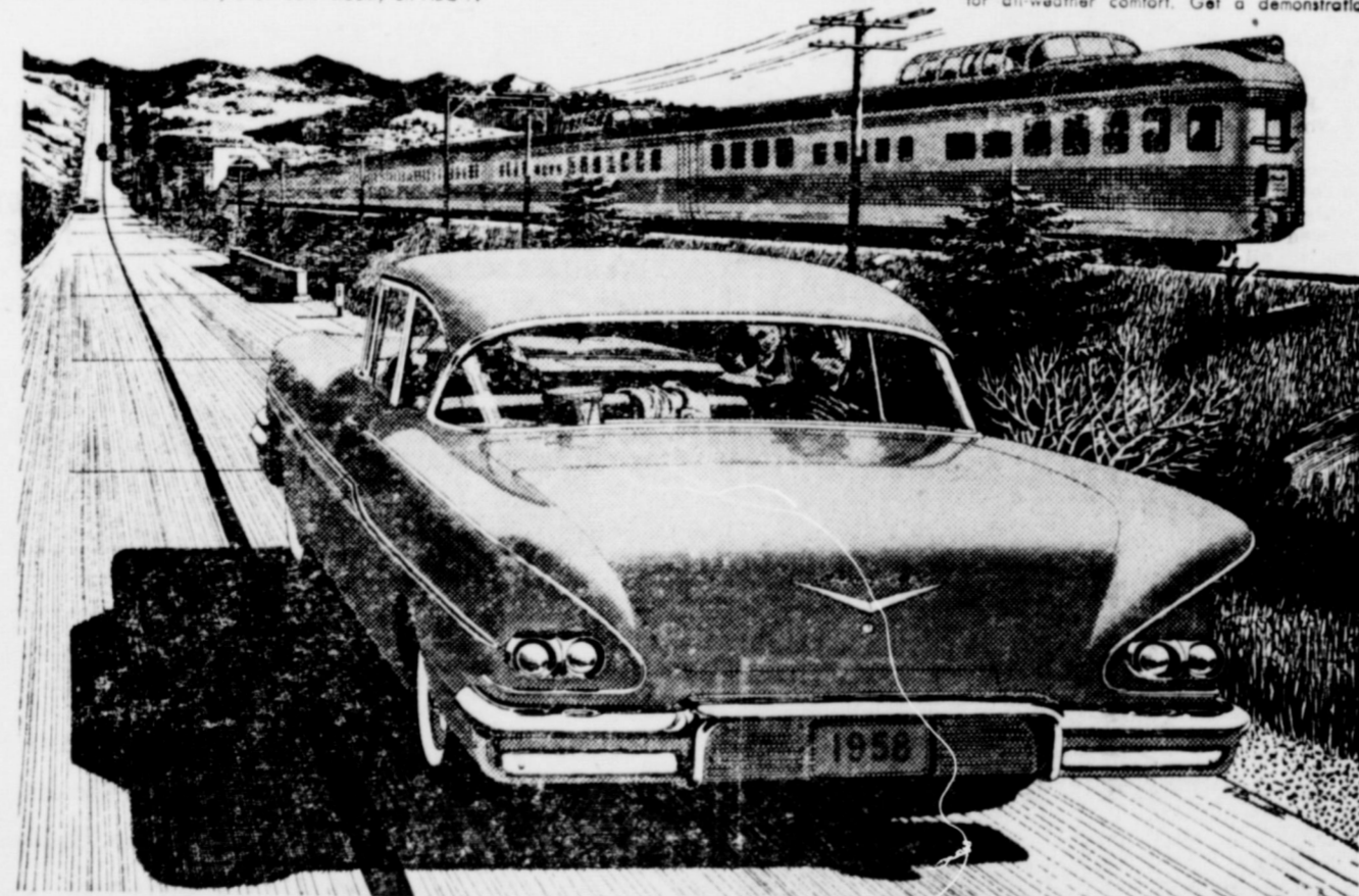
The Biscayne Two-Door Sedan with Body by Fisher. Every window of every Chevrolet is Safety Plate Glass.

NOTHING SO NEW—NOTHING SO NICE—NEAR THE PRICE!