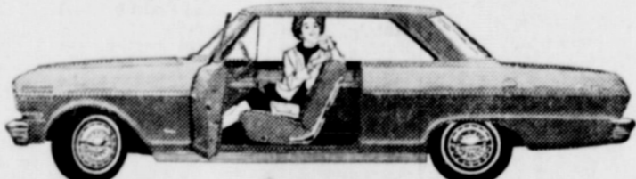
Chevy II Nova 400 Sport Coupe