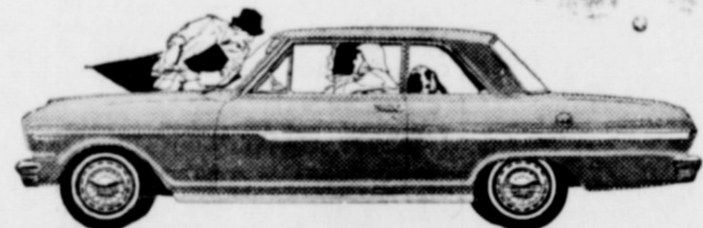
Chevy II Nova 400 2-Door Sedan