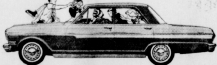
Chevy II Nova 400 4-Door Sedan