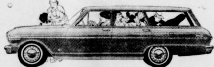
Chevy II Nova 400 4-Door Station Wagon