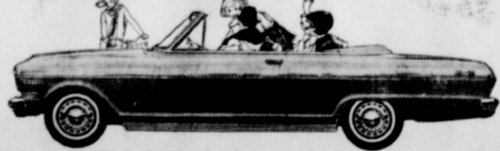
Chevy II Nova 400 Convertible

See the new Chevy II, new Chevrolet and new Corvair at your local authorized Chevrolet dealer's