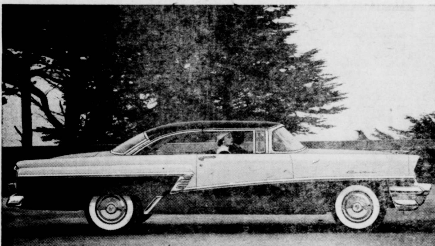
MERCURY CUSTOM HARDTOP COUPE—one of eighteen BIG M beauties in four price ranges that give you more usable horsepower and Safety-First Design.

Now! At no extra cost . . . you get 235-hp in Montereys and Montclairs . . . 225-hp in Medalist and Custom models when equipped with optional Merc-O-Matic Drive.