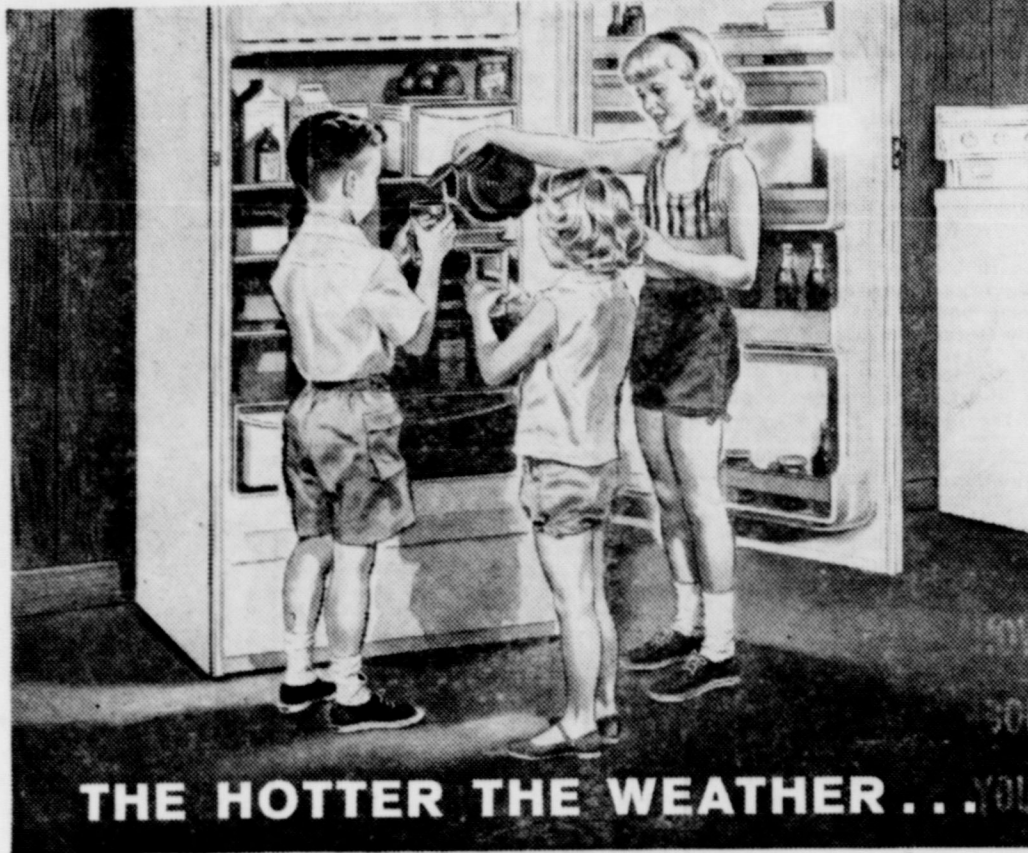
THE HOTTER THE WEATHER... YOU

The more you'll appreciate the RESERVE POWER of your ELECTRIC refrigerator