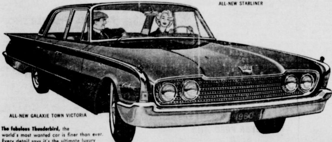
ALL-NEW GALAXIE TOWN VICTORIA

The fabulous Thunderbird, the world's most wanted car is finer than ever. Every detail says it's the ultimate luxury car. Performance is perfection.