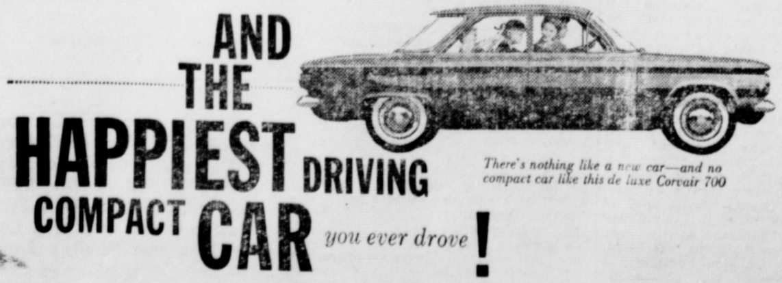
There's nothing like a new car—and no compact car like this de luxe Corvair 700

Corvair BY CHEVROLET the happiest driving compact car