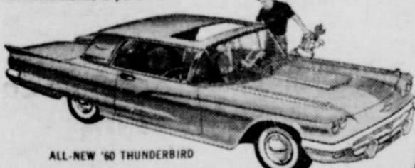
ALL-NEW '60 THUNDERBIRD

The fabulous Thunderbird, the world's most wanted car is finer than ever. Every detail says it's the ultimate luxury car. Performance is perfection.