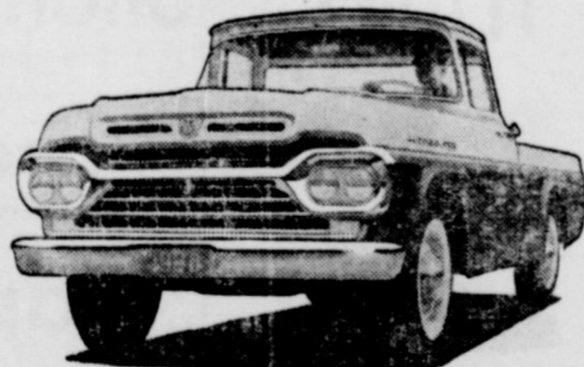
LIGHT DUTY—LOWEST PRICED OF THE LEADING MAKES! And look what the low price of this half-ton Styleline includes! New 23 1/2% more rigid frame, new longer-lasting brakes, new styling and comfort, new Diamond Lustre Finish!

CERTIFIED GAS SAVINGS • CERTIFIED DURABILITY CERTIFIED RELIABILITY • CERTIFIED LOWEST PRICES