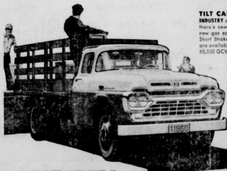
MEDIUM DUTY—LOWEST PRICED OF THE LEADING MAKES! In addition to lowest price, this F-600 Stake offers increased strength in frame and sheet metal... colorful new cab interiors... the gas savings of Ford's modern Six. Maximum GVW, 21,000 lb.

FORD TRUCKS COST LESS LESS TO BUY... LESS TO RUN... BUILT TO LAST LONGER, TOO!