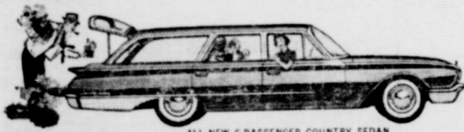
ALL-NEW 6-PASSENGER COUNTRY SEDAN

What a year to go Ford! Why not own the latest version of the world's most wanted wagon? Or perhaps you'd like the new, beautifully proportioned Galaxie below... an economy-minded Fairlane... or a big-value Fairlane 500. Maybe you'd like the brand-new Starliner at right or a sleek new Sunliner convertible.