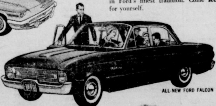
ALL-NEW FORD FALCON

Don't wait another second to see the car all America's been waiting for! The New-size Ford, the Falcon, lives up to your dreams of low price... ease of upkeep... and handling ease. And it's lovely to look at!