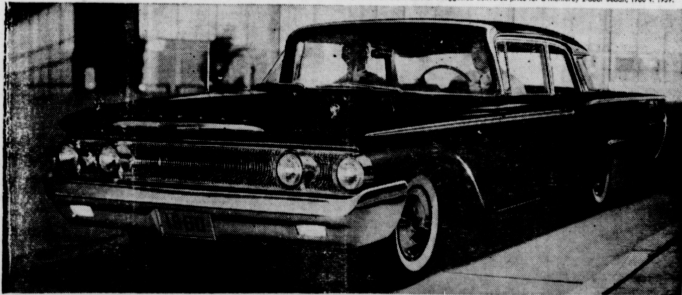
1960 Mercury Monterey 2-door Sedan with deluxe interior and complete carpeting at no extra cost.

*Based on manufacturer's suggested delivered price for a Monterey 2-door Sedan, 1960 v. 1959.