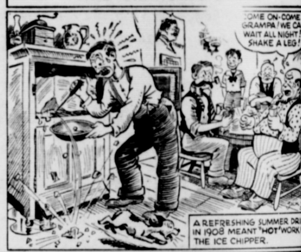
A REFRESHING SUMMER DRINK IN 1908 MEANT "HOT WORK" THE ICE CHIPPER.