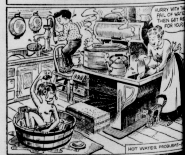
HOT WATER PROBLEMS