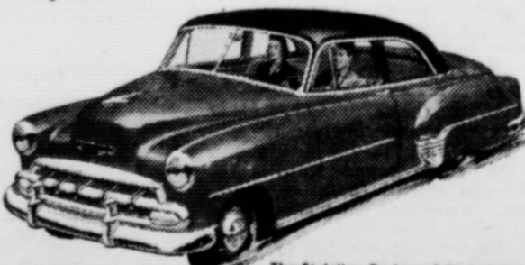
The Styleline De Luxe 2-Door Sedan.

(Continuation of standard equipment and trim illustrated is dependent on availability of material.) MORE PEOPLE BUY CHEVROLETS THAN ANY OTHER CAR!