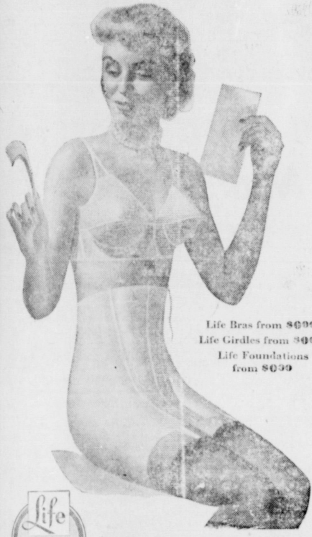
Life Bras from $6.99 Life Girdles from $6.99 Life Foundations from $6.99

It's Formfit Week in our corset department, time to discover the happy way to a lovelier figure. Delightful , how our trained fitters make nothing of your figure problems! Joyous , how they fit you in the Life Bra, Girdle or Foundation exactly right for you! Blissful , the freedom-giving way these comfortable Formfit creations make the most of your charms! Styles, fabrics, elastics to flatter every figure...so stop in today.