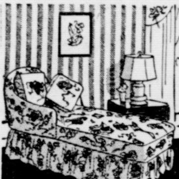
and add gay color to bedrooms.

Storage is another big problem that can be remedied. If the man of the house has carpenter's ability or is even interested in it, built-in dressers and chests can be made for the room.