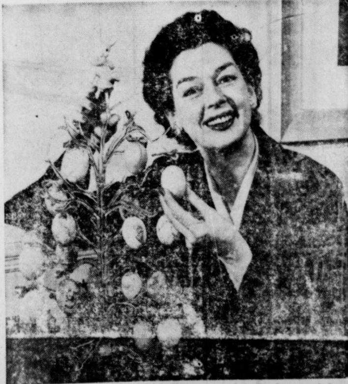
Rosalind Russell, star of stage, screen, and radio, borrowed from Old World folk-lore the idea of decorating an Easter egg tree at Easter time. Decorating trees with gaily-colored eggs at this season once was a cherished family custom in many localities of Europe, according to the "Poultry and Egg Nation" by Mrs. Russell, currently starring in "Bell, Book and Candle" in Chicago, said she finds it is "just as much fun and more practical" in her case to adapt the idea of an Easter egg tree as a centerpiece.

For the convenience of those who live in and around O'Donnell, Texas a representative of the social security office will be at the post office in O'Donnell on Thursday, April 15, 1952 at 4:30 P. M.