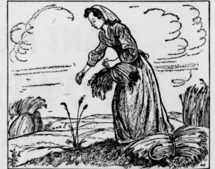
3. What Old Testament woman is this? (See answer on a following page)