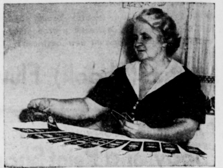
Prize winner praises results she gets with Active Dry Yeast

FINE DOUBLE FILTERED FOR EXTRA QUALITY - PURITY BURNS MOROLINE PETROLEUM JELLY