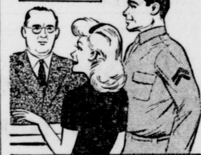
"... hasty courtship . . ."

"He pays, yes. But he never pays on time. I have to telephone every month, and sometimes have to ask my lawyer to jog his memory. Sometimes he writes me a little note with his check, saying something insulting like how long am I going to keep this up, haven't I found someone who wants to marry me?"