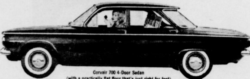
Corvair 700 4-Door Sedan (with a practically flat floor that's just right for feet)

See Chevrolet Cars, Chevy's Corvair and Corvette at Your Local Authorized Chevrolet Dealer's