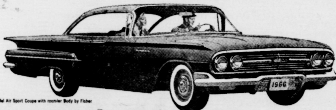
Bel Air Sport Coupe with roomier Body by Fisher

This year, more people are buying Chevrolets (including Corvairs) than ever before, making Chevy the year's hottest seller by a record-shattering margin. Come in and see what the buying's all about—at your Chevrolet dealer's soon!