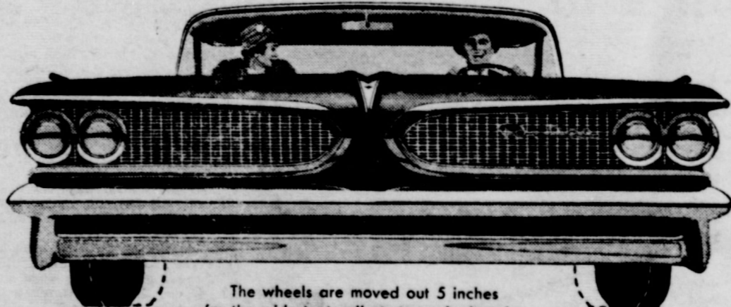
The wheels are moved out 5 inches for the widest, steadiest stance in America.

No "narrow-gauge" car corners as surely as PONTIAC!