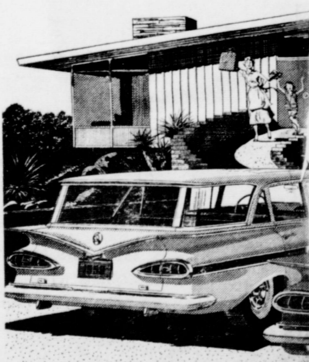
The 6-passenger Nomad and the Impala 4-Door Sport Sedan